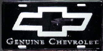
2344 GENUINE CHEVROLET