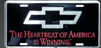
2332 HEARTBEAT OF AMERICA WINNING