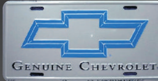
2431 GENUINE CHEVROLET