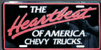
292 HEARTBEAT OF AMERICA CHEVY TRUCKS