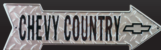
AS25002 CHEVY COUNTRY