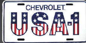
104 CHEVROLET USA-1