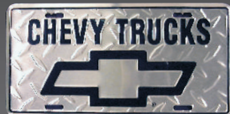
2457 CHEVY TRUCKS