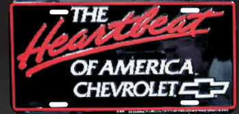
295 HEARTBEAT OF AMERICA CHEVROLET