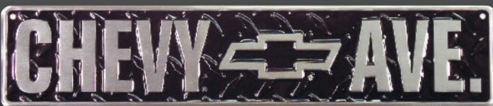
STR20063 CHEVY AVE