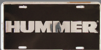
SUP50116 HUMMER (DELUXE)