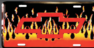
2593 CHEVY BOWTIE WITH FLAMES