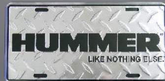
2620 HUMMER (DIAMOND)